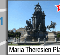
Maria Theresien Platz